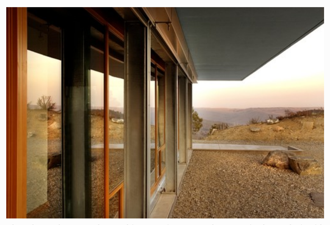
Photo by Eggleston Farkas Architects - Discover modern exterior home design ideas \,

Did you know that an overcast sky is three times brighter at the zenith (the highest point in the sky dome) than at the horizon? If you live in a predominantly overcast area like the Pacific Northwest, this is the perfect environment to let in that bright light from above and maximize free illumination. In an area with predominantly clear skies, be aware of the placement of windows, so as not to have unwanted glare from direct sun.