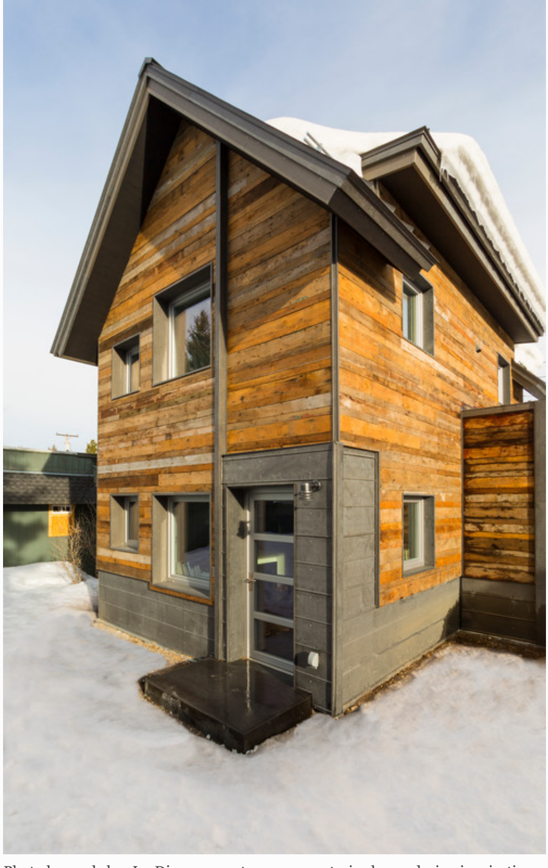
Discover contemporary exterior home design inspiration