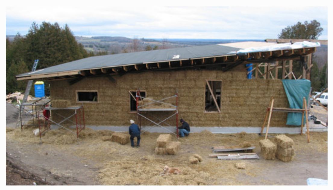
By Electric Bowery Venice - See more Home Design Photos

Increasing the amount of insulation will lower the loads on your heating and cooling system. For this Colorado home, which is not off the grid but was designed using Passive House methods, the insulation package consists of R-100 for the roof, R-55 for the walls and R-50 for the floor. Thanks to that, the primary spaces can be heated using only a small gas fireplace.