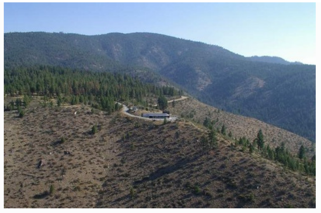
Photo by Eggleston Farkas Architects - Search modern exterior home pictures