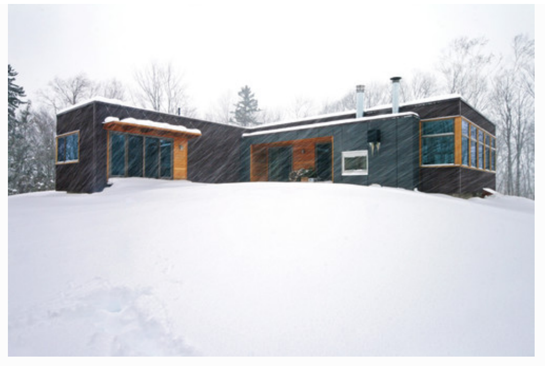
Photo by Resolution: 4 Architecture - Search modern exterior home pictures

When will you know you have a superefficient building envelope? When the weather outside is beautiful to look at, but you're glad you're inside.