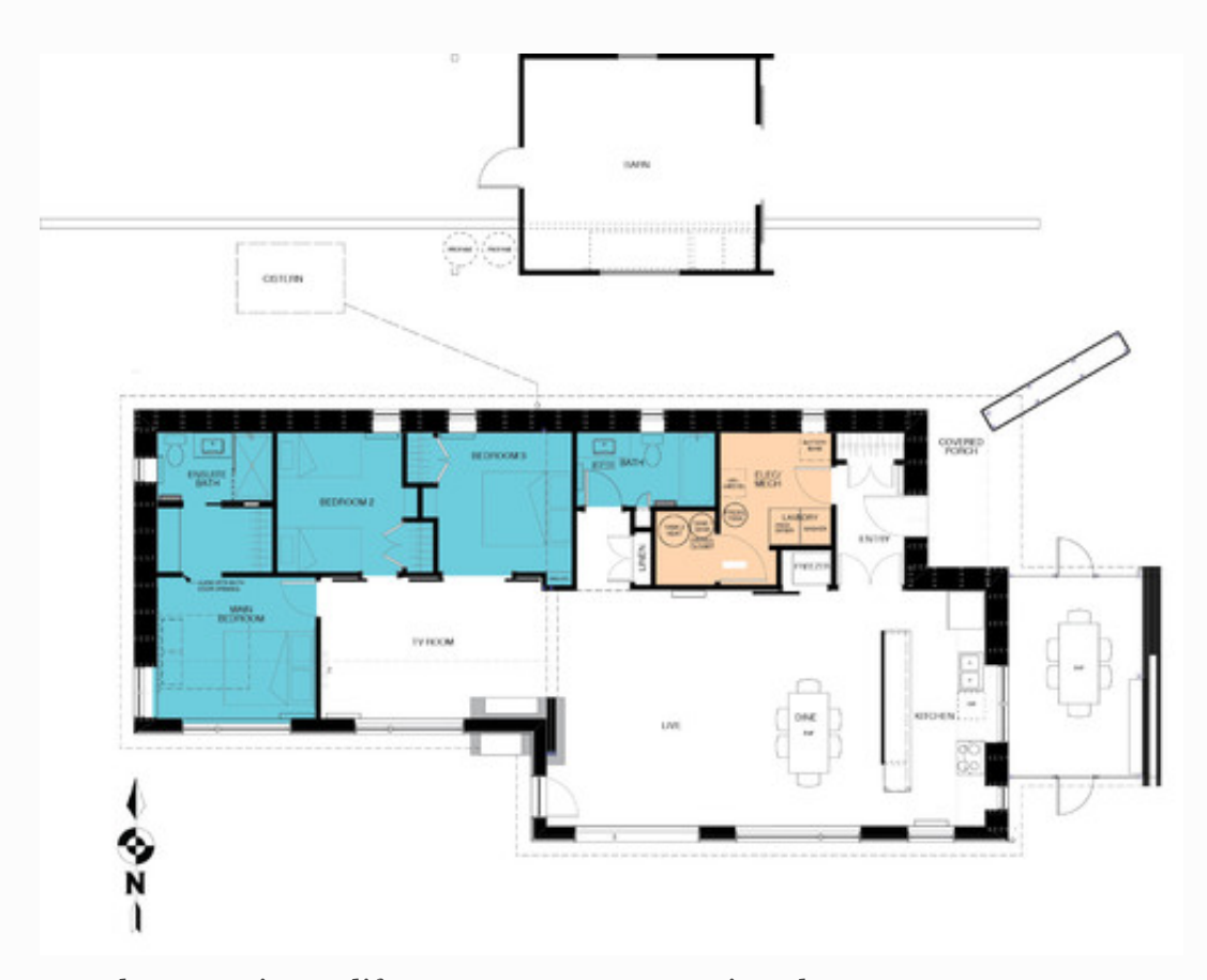
By Solterre Design Halifax - See more Home Design Photos

Both the shape and the construction of your home will greatly influence the heating and cooling requirements. For example, a building in a hot, arid climate experiences a large load from the sun in the summer. If the building is shaped in a way that reduces exposure to the sun — the glass is shaded by a large overhang and the walls are well insulated — the solar gain can be minimized and cooling requirements can be decreased, saving energy.